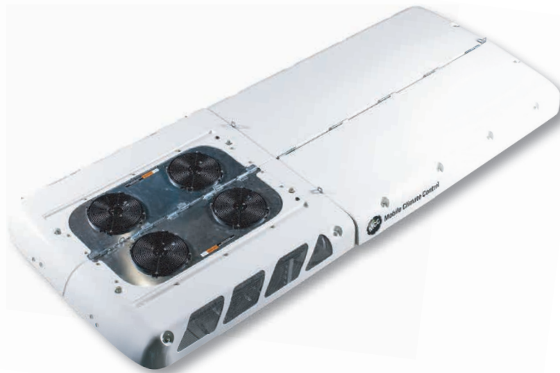
Eco 353 Narrow

The system uses MCC's micro-channel heat exchanger (MCHX) coil technology, which delivers significant performance improvements through better heat transfer and thermal performance. Extended motor life is available through the use of brushless motors.