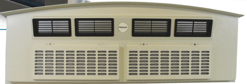
Advanced airflow louver design