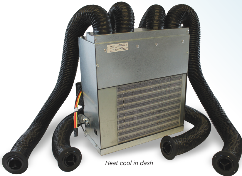
Heat cool in dash